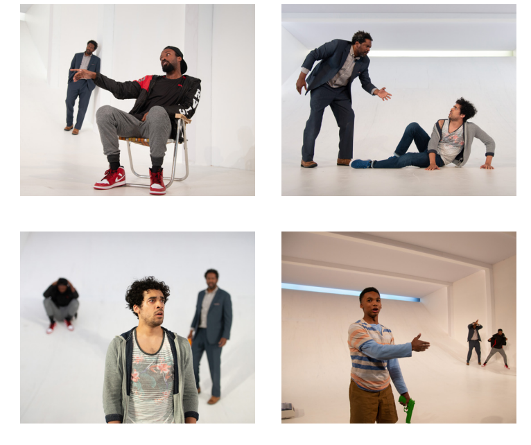
(Examples of the cast's costumes,)